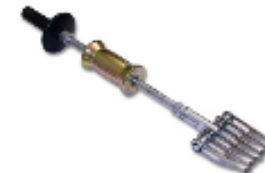
6) Slide hammer with hook for pull claw