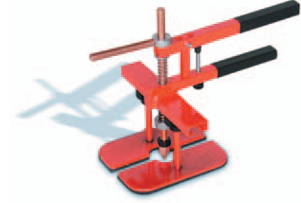
2) Manual pulling gun with 3 electrodes