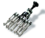
9) Set of 9 pull hooks for Power Lifter

Al-Barakat Detail Plus Saudi Arabia Jeddah P.O.BOX101026 ZIP 21311 TEL 966551266909 FAX 96626687424 Email albarakatgroup@gmail.com