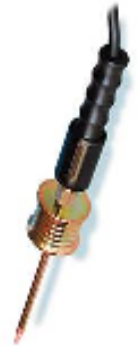
5) Small sliding weight with long electrode