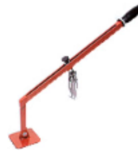
3) Power lift pulling lever